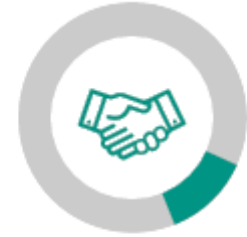
FINANCIAL EDUCATION AND COUNSELING